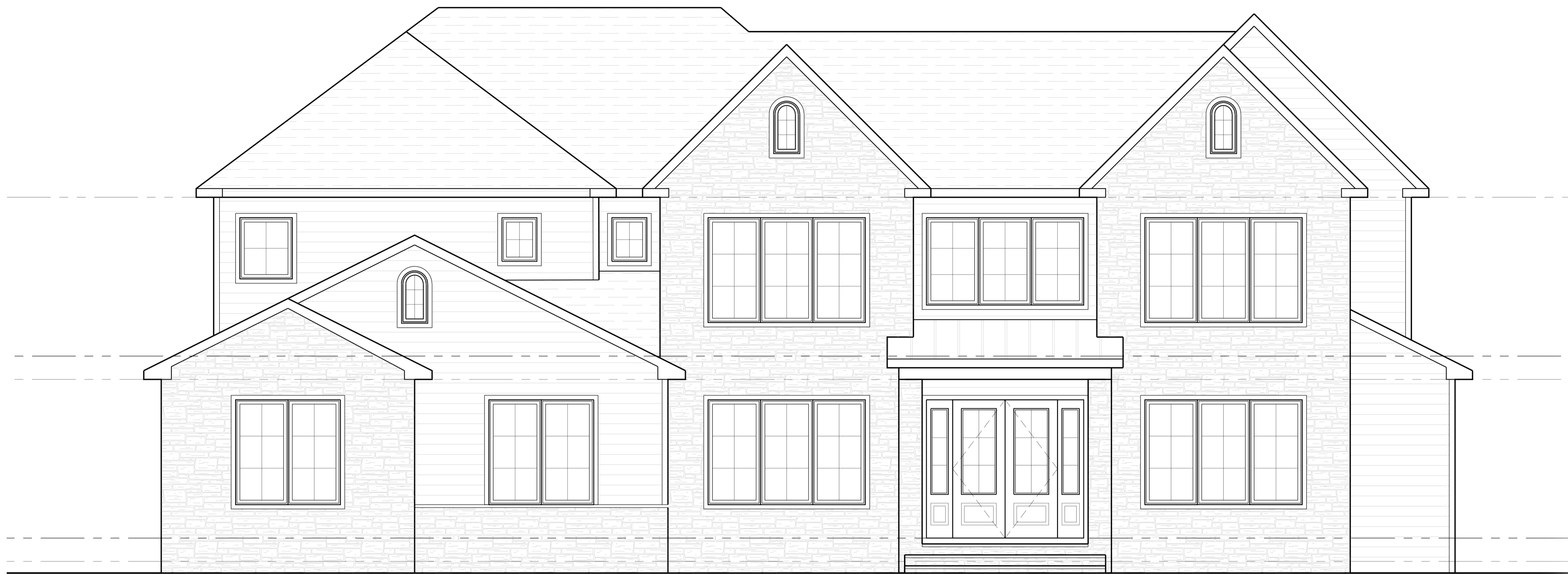
1 FRONT ELEVATION A-4 1/4" = 1'-0"