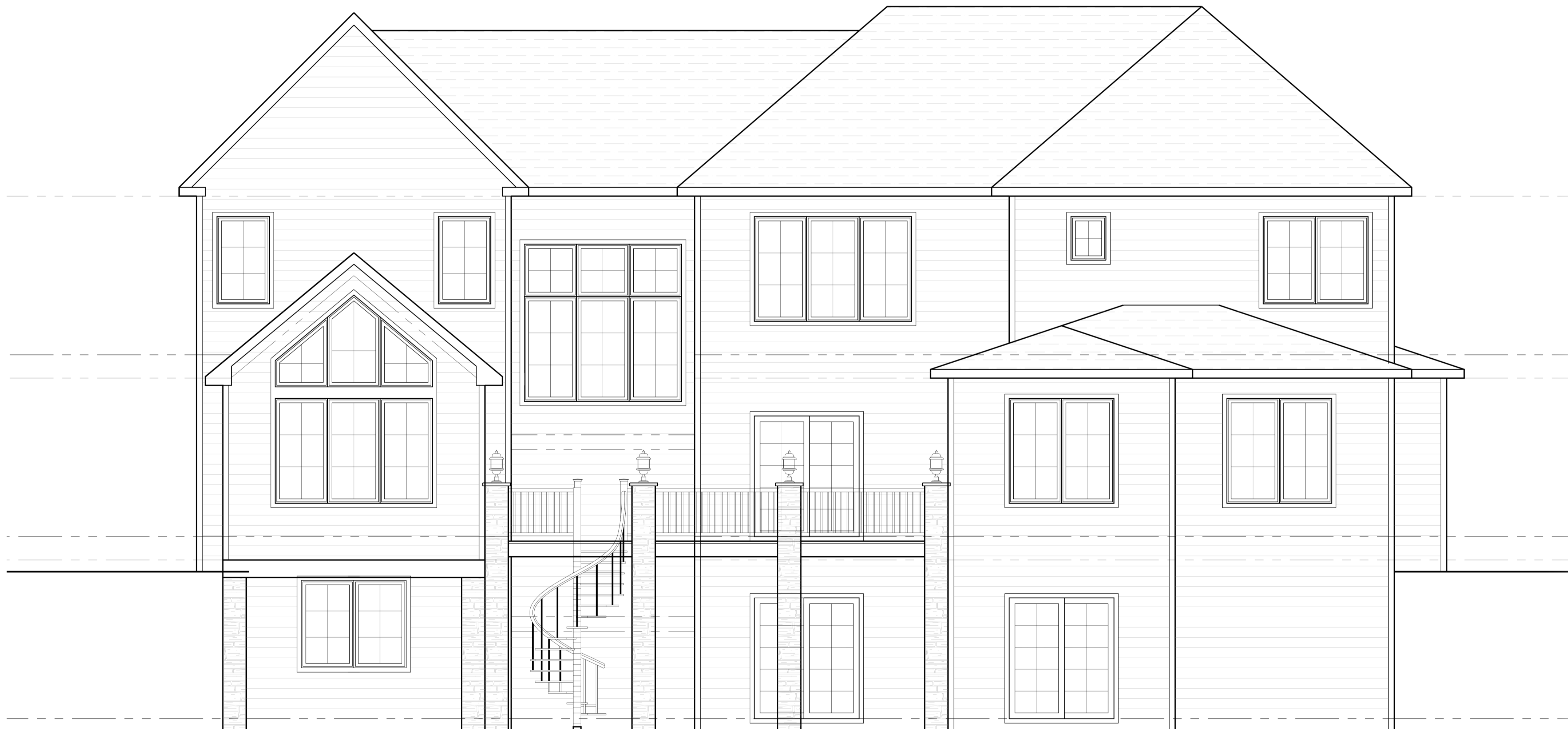
2 REAR ELEVATION A-4 1/4" = 1'-0"

FOR INFORMATION ONLY - NOT FOR CONSTRUCTION